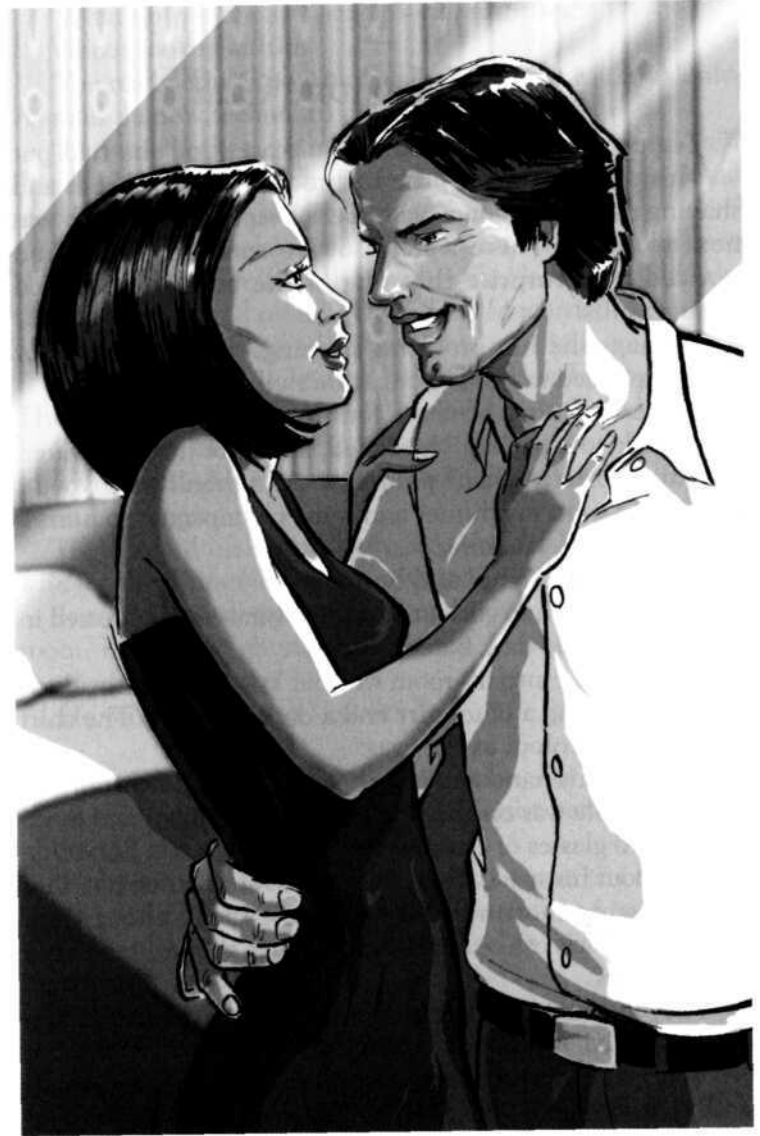
Vesper's eyes were shining and she put her hand on Bond's arm.

After some time, Bond came out of the water. He lay on the beach until his body was dry. Then he walked back to the hotel.