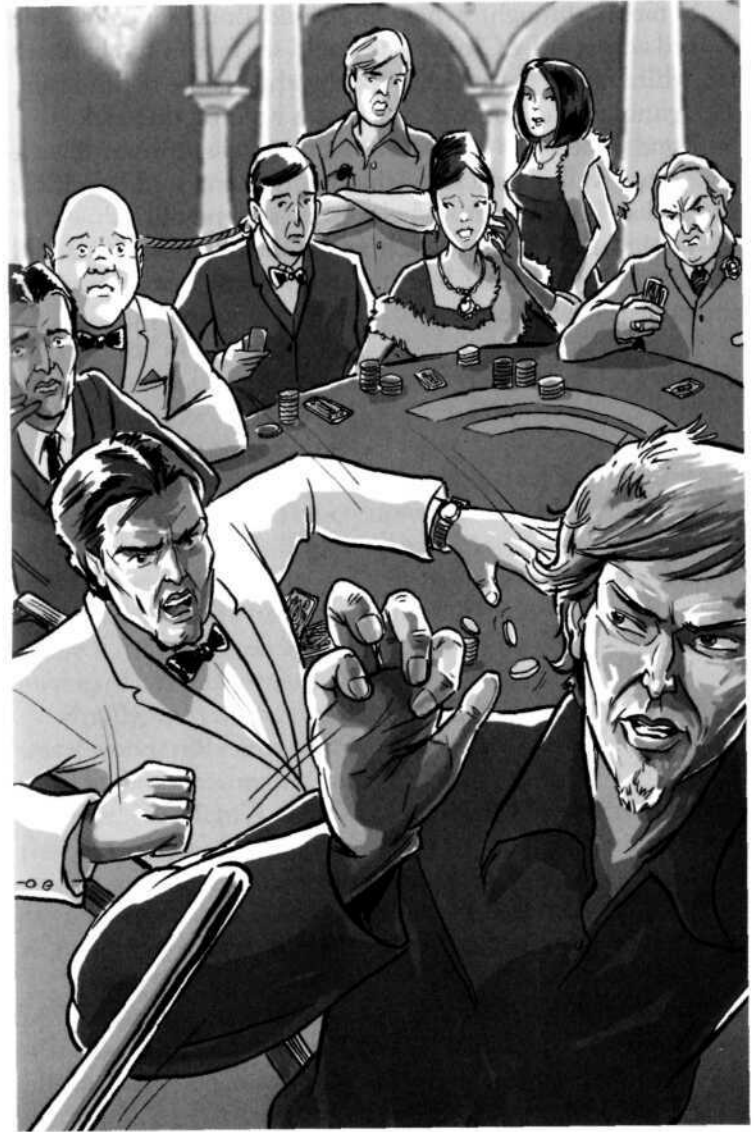
Bond moved so fast that the chair knocked the 'stick' from the gunman's hand.

'Thank you,' Bond said. 'I'm all right now. It was only a moment's faintness. I was a little hot.'