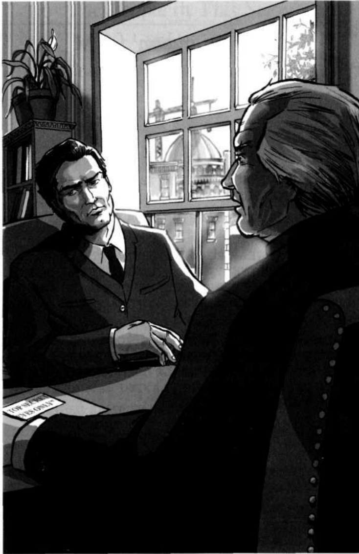
Bond was stopped by M's cold eyes. 'Le Chiffre can have bad luck, too,' M replied.