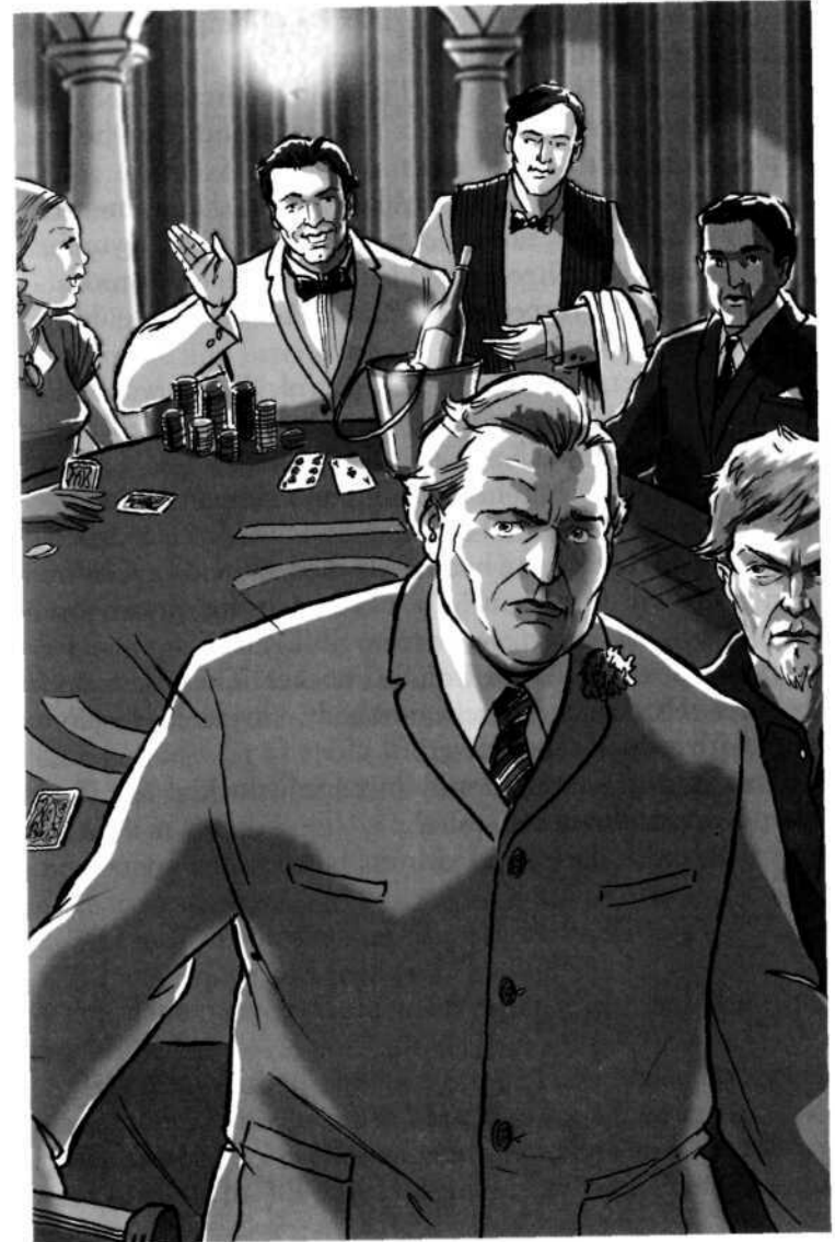
Le Chiffre was like a man who carried the smell of death.

'I'll take my winnings to the hotel,' he said. He turned to